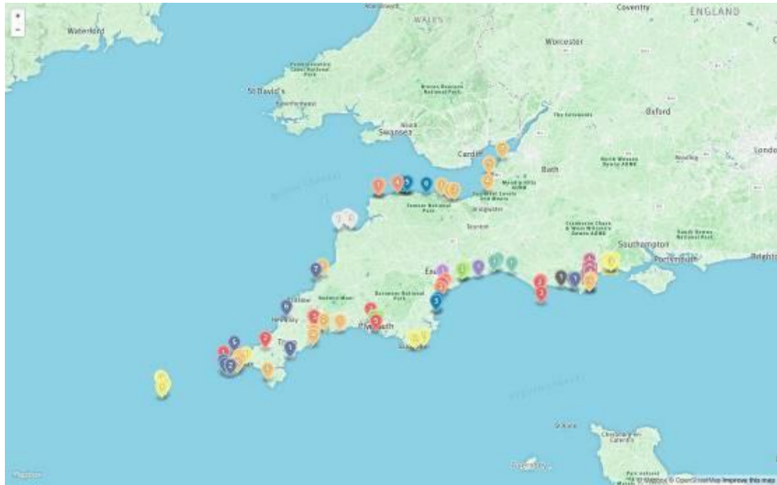
Figure 7.2 (above): On entering the zoom in/out topographical map the twenty-three colour-coded case studies can be seen, and the eighty-four individual locations.